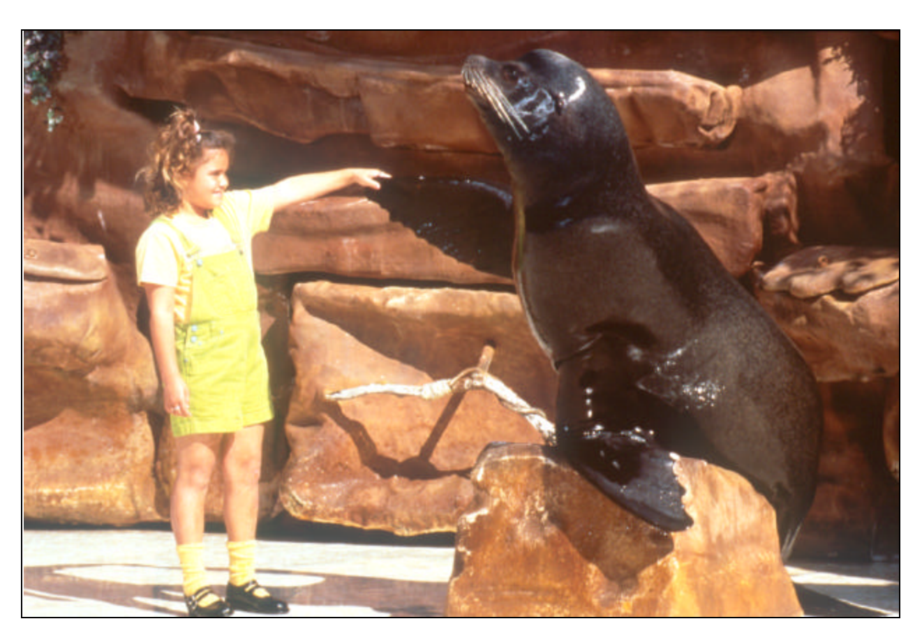
Lifting a flipper is a natural behavior for a sea lion. When we lift our arm too, the behavior looks like a handshake.

From Animal Behavior and Training K-3 Teacher's Guide, a SeaWorld Publication.