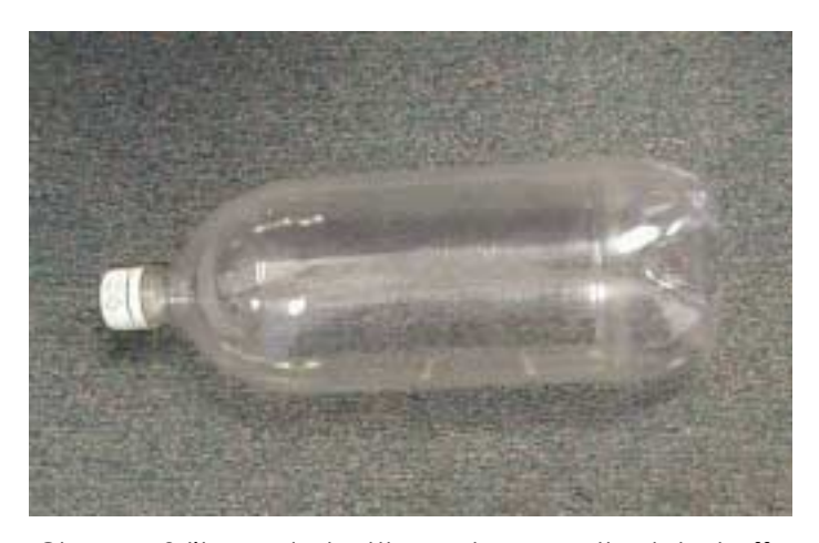
Clean a 2-liter soda bottle and scrape the label off.