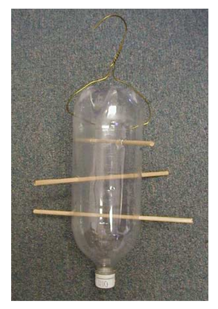
Feeder with wooden dowels and hanger attached.