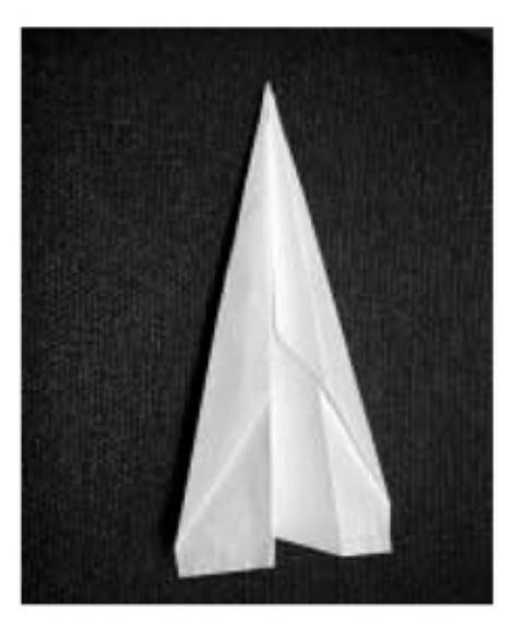
Fold back the wing on the other side.