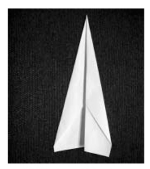
Fold back one of the wings.