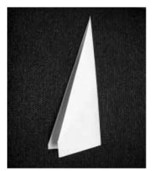
Fold airplane in half along the centerline of the paper's length.