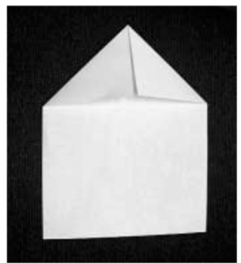
Fold down the top two corners, using the middle of the paper's width as a center point